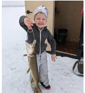
Big Fish by D. Hogberg