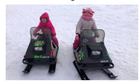
Young Cruisers