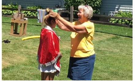
Crown the Princess

moved up to actual capes, crowns and broken oars as staffs. We still do the games with the Hauglands and other neighbors.