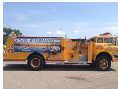
July 4 th Parade

Send your favorite lake photos to pliamn@yahoo.com or share them on our Facebook page!