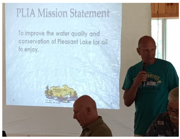
PLIA General Meeting at Summer Picnic