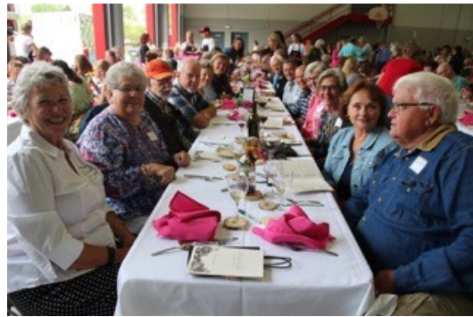
Field to Feast