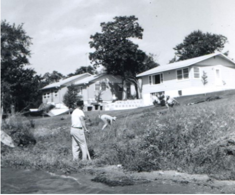
Cabin in 1962

Annandale, family and friends that always drew us back. So, in the 1970s, my parents bought a cabin on the East side of the lake. But as my grandparents aged, the decision was made to sell our Highway 24 cabin.